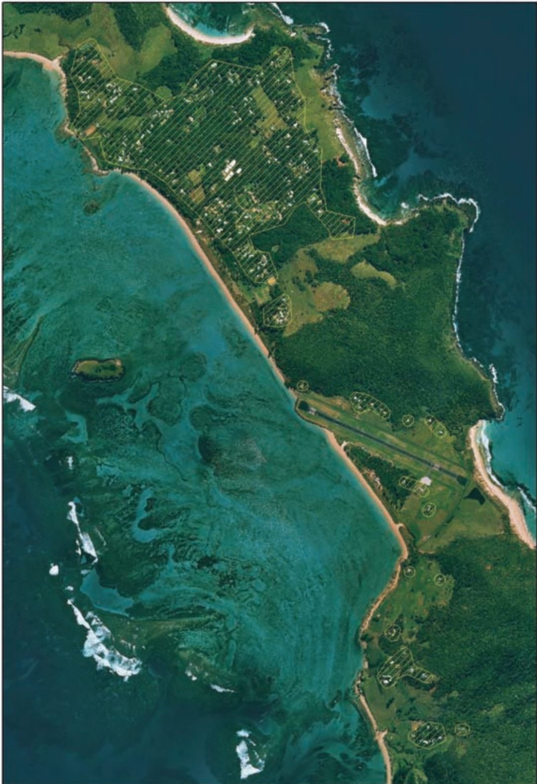
Figure 2. Areas proposed to be hand-baited (shaded areas)