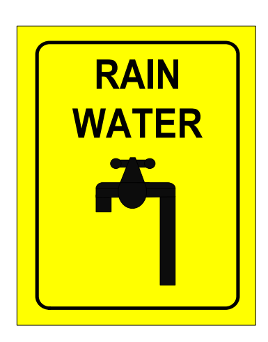
Table 0-1 Example of a rainwater sign

All taps where untreated rainwater is supplied be identified as 'RAINWATER' with a label or the rainwater tap identified by a green coloured indicator. Rainwater warning signs should comply with Australian Standard AS 1319 Safety Signs in an Occupational Environment . Their location should be record as per the table below