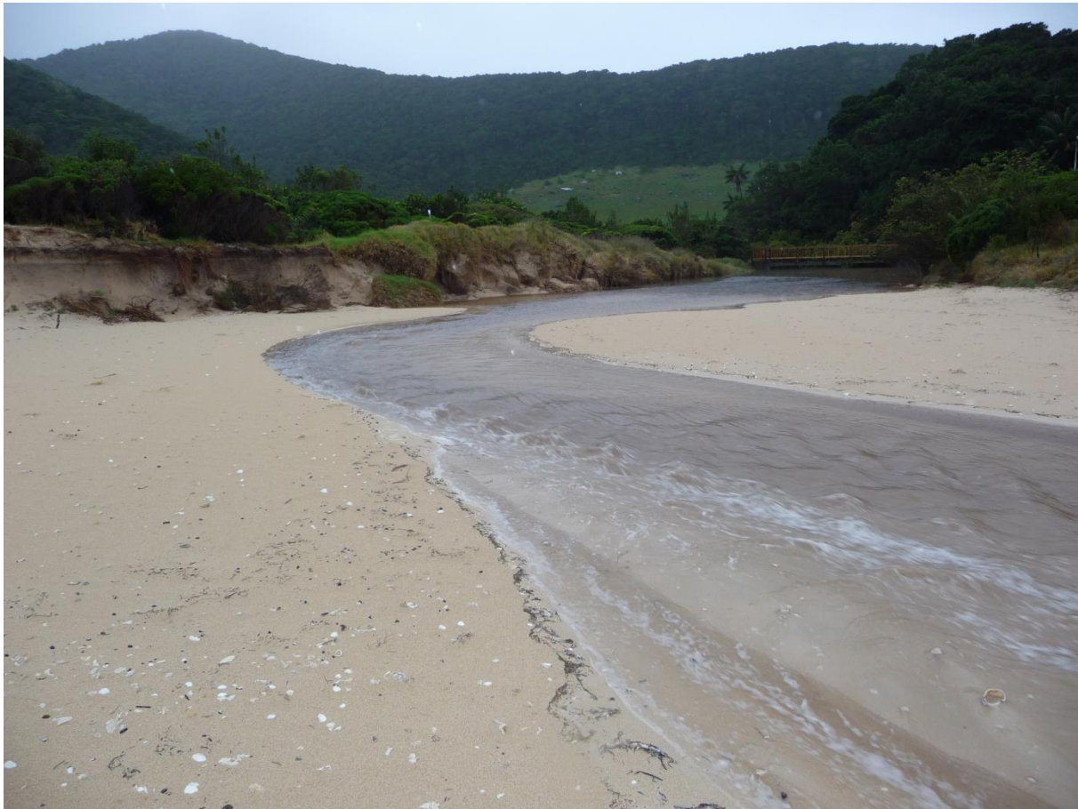
Figure 40: Natural opening of Old Settlement Creek, 31 August 2012

There are two cattle crossings (muddy tracks) over Old Settlement Creek (see Figure 41) that, due to trampling and associated erosion, may be sources of sediment and nutrients to be mobilised into the creek. It is recommended that there is consideration of works (such as hardening the crossings) to reduce potential mobilisation of sediment in these areas.