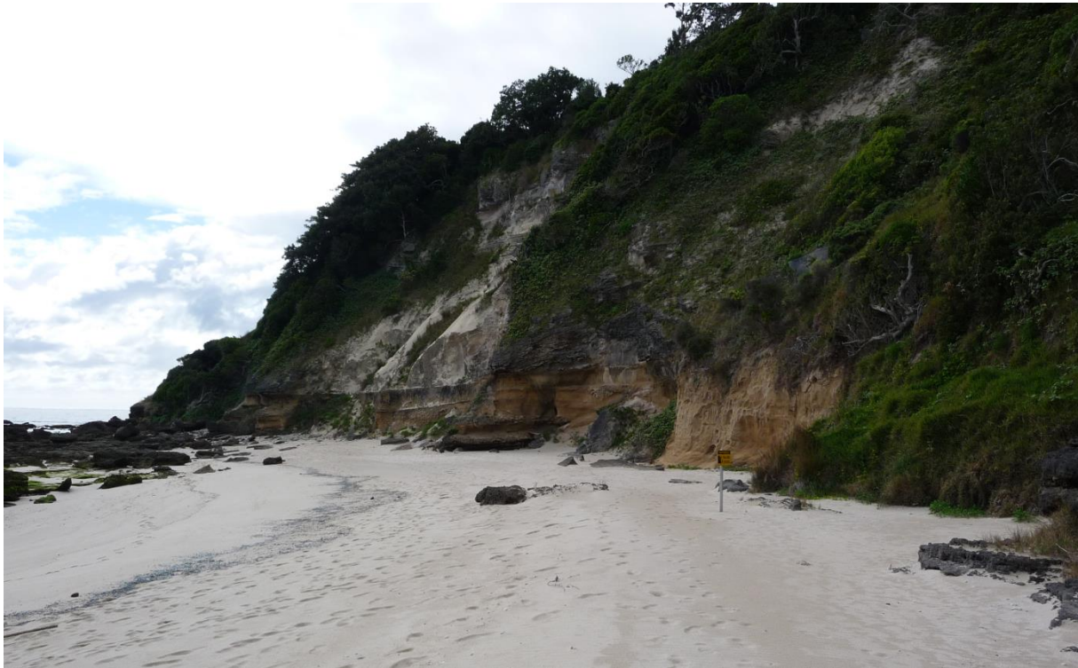
Figure 47: Cliff area at southern end of Neds Beach, with warning sign evident

At Signal Point, there was evidence of occasional block toppling, with some boulders located at the base of the cliff. Warning signs were noted at the bases of the northern and southern ends of the cliff.