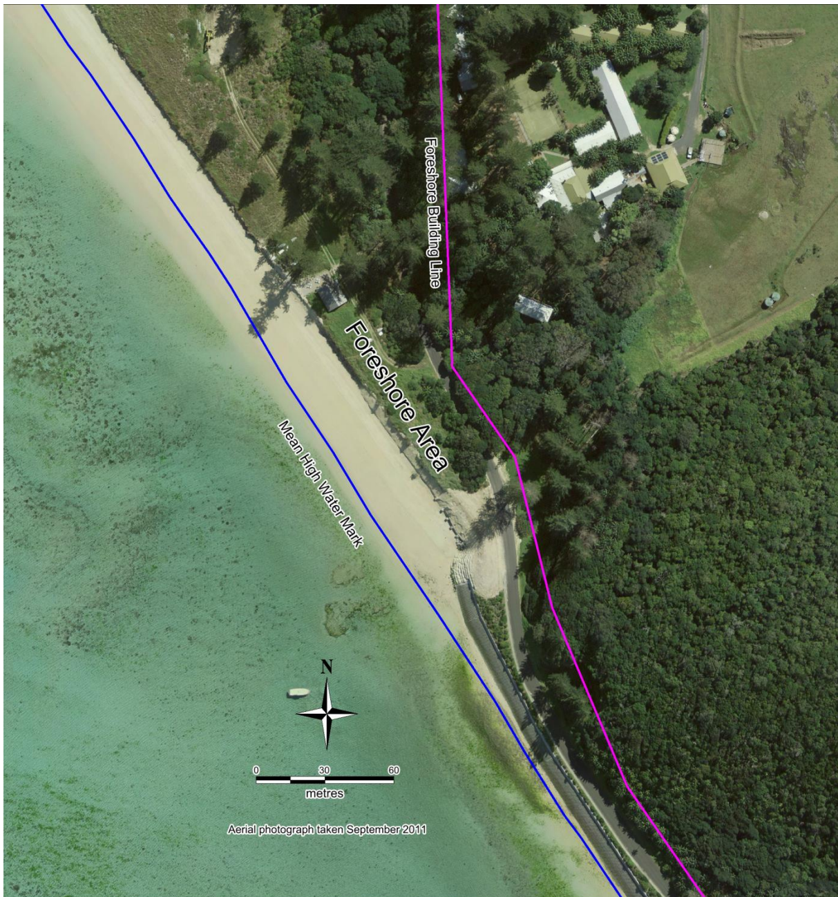
Figure 50: Foreshore area in vicinity of Pinetrees boatshed