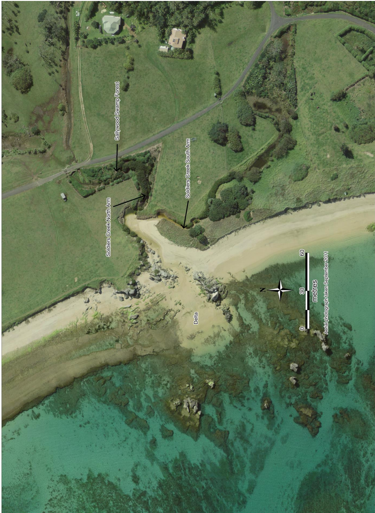
Figure 45: Aerial photograph of Soldiers Creek entrance, with delta evident