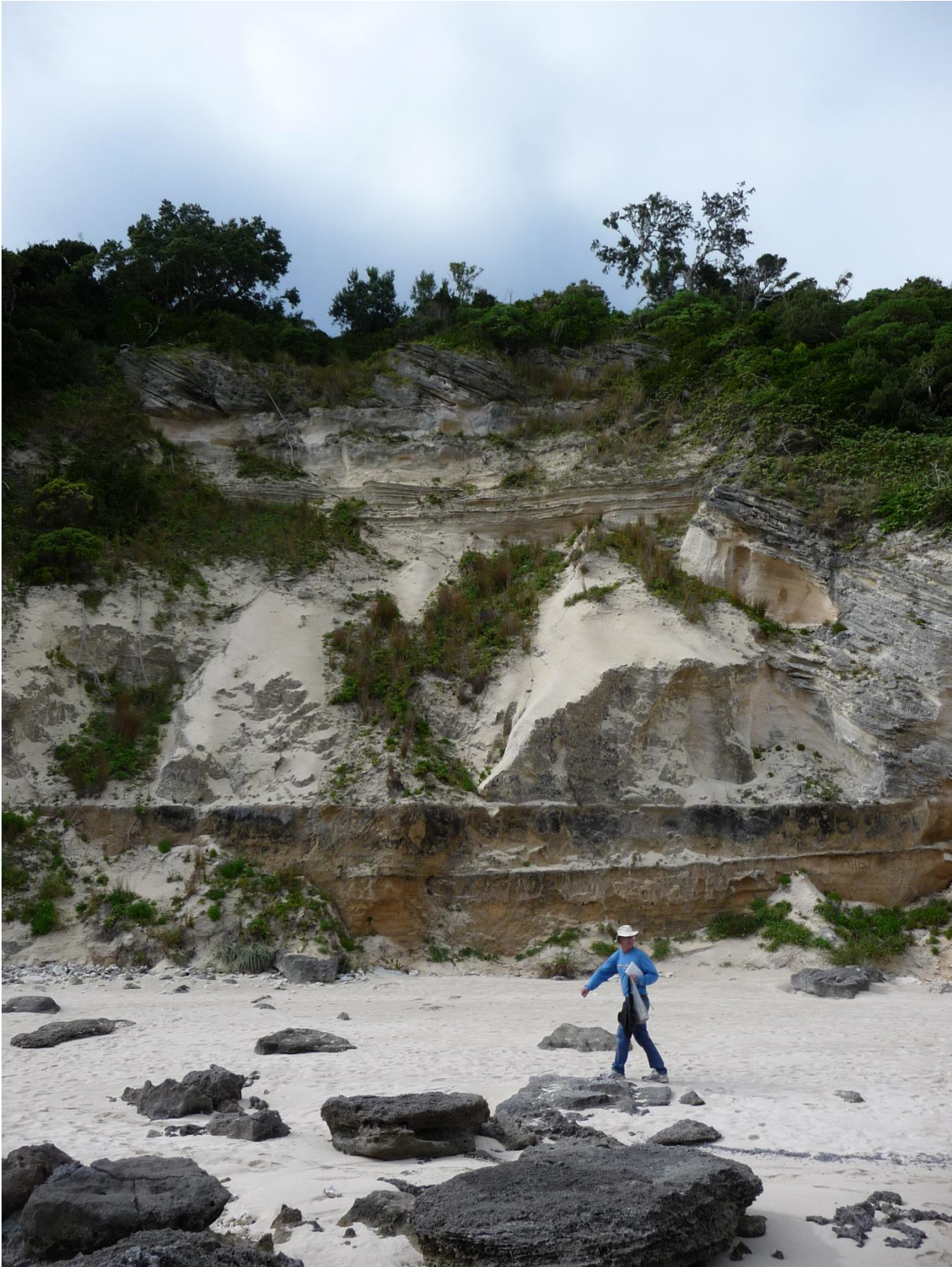
Figure 48: Area of some cliff instability at southern end of Neds Beach