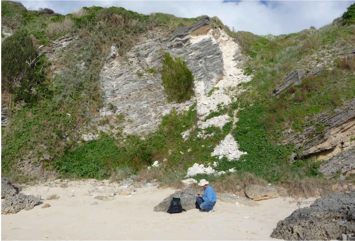
Figure 49: Cliff “failure” at northern end of Middle Beach, 28 August 2012

The cliff “failures” at Neds Beach, Middle Beach and Signal Point are considered to be mostly related to weathering of the calcarenite, which as noted in Section 4.1 is extremely susceptible to weathering.