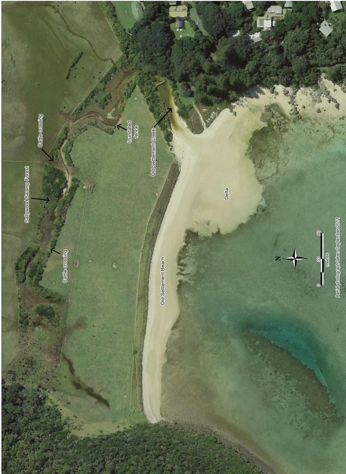
Figure 41: Aerial photograph of Old Settlement Creek entrance, with delta evident