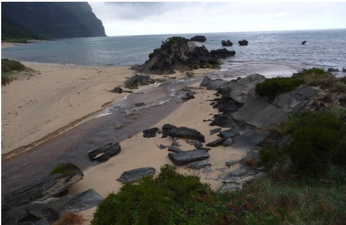
Figure 44: Natural opening of Soldiers Creek, 31 August 2012

There is a delta of sand formed within the Lagoon seaward of Soldiers Creek, extending about 30m offshore and 30m alongshore, as visible in 2011 aerial photography (Figure 45). Given the surrounding rocks, and that this delta may only be a veneer of sand over rock, using this sand as a beach nourishment source is unlikely to be considered in preference to the Old Settlement Creek and Cobbys Creek sites.