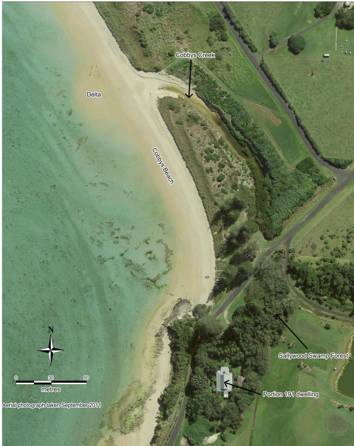
Figure 43: Aerial photograph of Cobbys Creek entrance, with delta evident