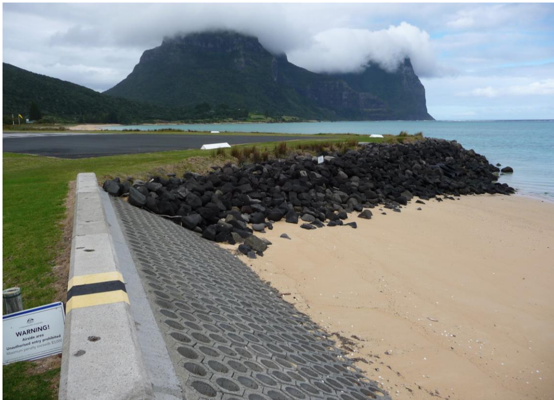
Figure A1: Southern end of Lagoon Beach at junction between airport revetment and Seabee wall, looking south

A series of photographs taken from south to north along Lagoon Beach is provided in Figure A1 to Figure A7. Note that the mounded sand visible seaward of the erosion escarpment in Figure A4 and Figure A5 had recently been mechanically placed (it had been sourced by beach scraping from about 100m to 300m north at around the low tide level).