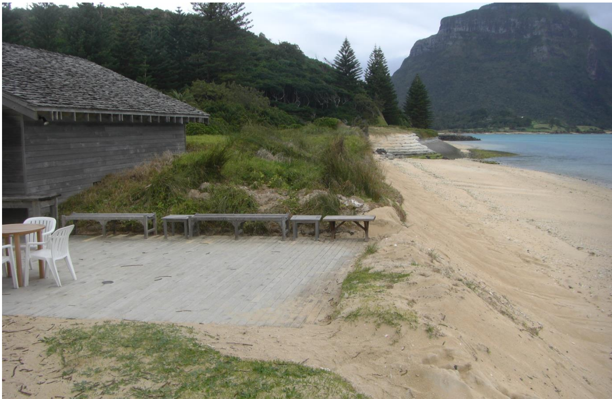
Figure 38: Erosion escarpment adjacent to deck at Pinetrees boatshed in August 2012

In August 2012, the erosion escarpment at Pinetrees boatshed was measured as being 7.6m from the seaward face of the structure, with the deck seaward of the boatshed within 1m of the escarpment (Figure 38).